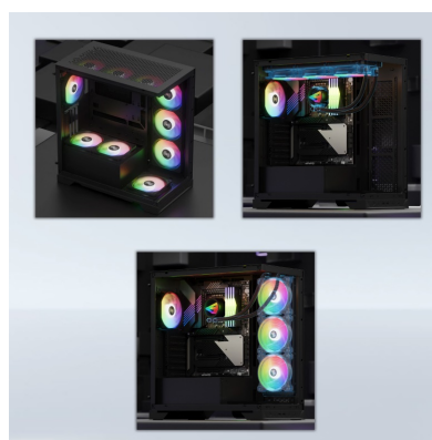
Enhanced Cooling for Better Performance