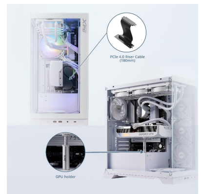
Install GPU Vertically Or Horizontally