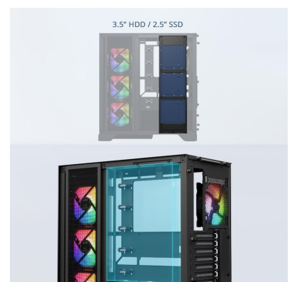
Supports the Latest Motherboards