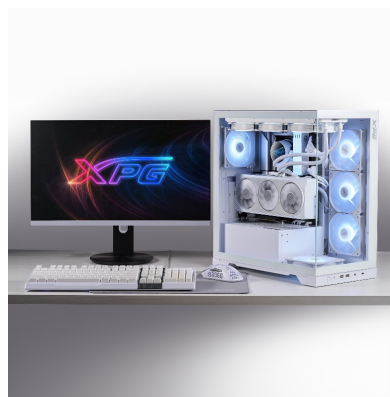
Next Gen Ready