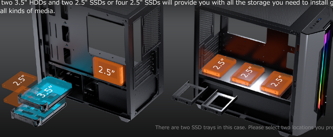
There are two SSD trays in this case. Please select two locations you prefer to install.

Up to two 3.5" HDDs and two 2.5" SSDs or four 2.5" SSDs will provide you with all the storage you need to install games and store all kinds of media.