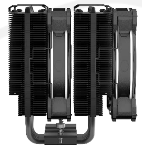
Broad Case Fitment

Dual loop LED 120mm Halo 2 fan features stunning lighting with improved fan performance