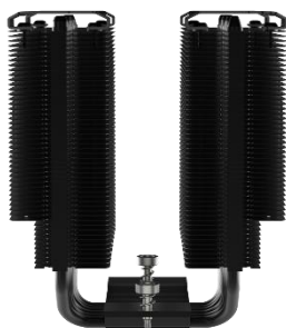
Dual Tower Heat Sink

Low profile heat pipes optimized at 157mm height accommodates most RAM and case requirements