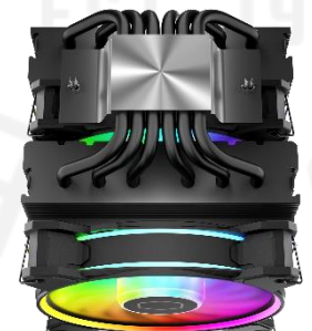
6 Heat Pipes Design

Upscale design featuring aluminum top cover and signature logo