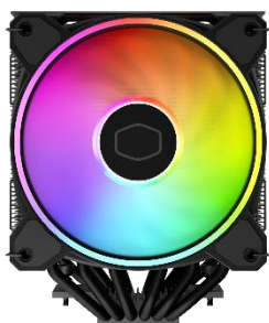
ARGB Auto Detection

Intuitive LED detection automatically provides default ARGB spectrum lighting or full ARGB customization via 3-pin header connection