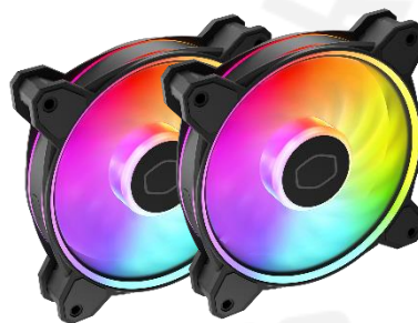
Dual Redesigned Halo 2 Fan

Intuitive LED detection automatically provides default ARGB spectrum lighting or full ARGB customization via 3-pin header connection