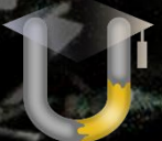
Composite Heat Pipes

An absolute blending of tech and art. The Exquisite Backplate comes with golden ratio cut-outs for maximized air venting efficiency. The engraving and gloss highlight on the plate add a flash of brightness in the midnight.