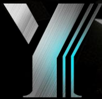
Y Formula Fins

The brand new Gale Hunter Fan is thicker and bigger in size for strongest airflow. With winglet on the fantail, the airflow will be concentrated and vortex effect can be avoided. The advanced Gale Talon design on the fan blades further brings the air to the thermal module in a smooth and stable pattern.