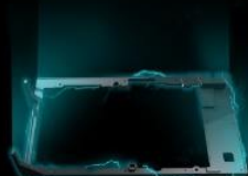
Anti Gravity Plate

Combining the 6Ø and 8Ø heat pipes, the Composite Heat Pipes stably transfer the heat in the most efficient way not only under daily applications, but even under heavy loading conditions such as extreme overclocking.