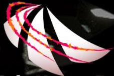
Gale Hunter Fan

The simple yet sophisticated black crystal design shows the high-class gaming style of its user. Looking closer, you'll find the twinkling stars are plucked out of the sky and embedded in the cooler surface, making the GameRock OmniBlack a real art piece and a powerful gaming gear even with no RGB lights.