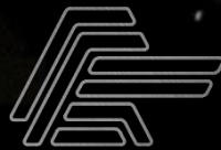
Exquisite Metal Backplate

A large copper base processed with anti-oxidation technology is adhered with both the GPU and DRAM to effectively absorb heat.