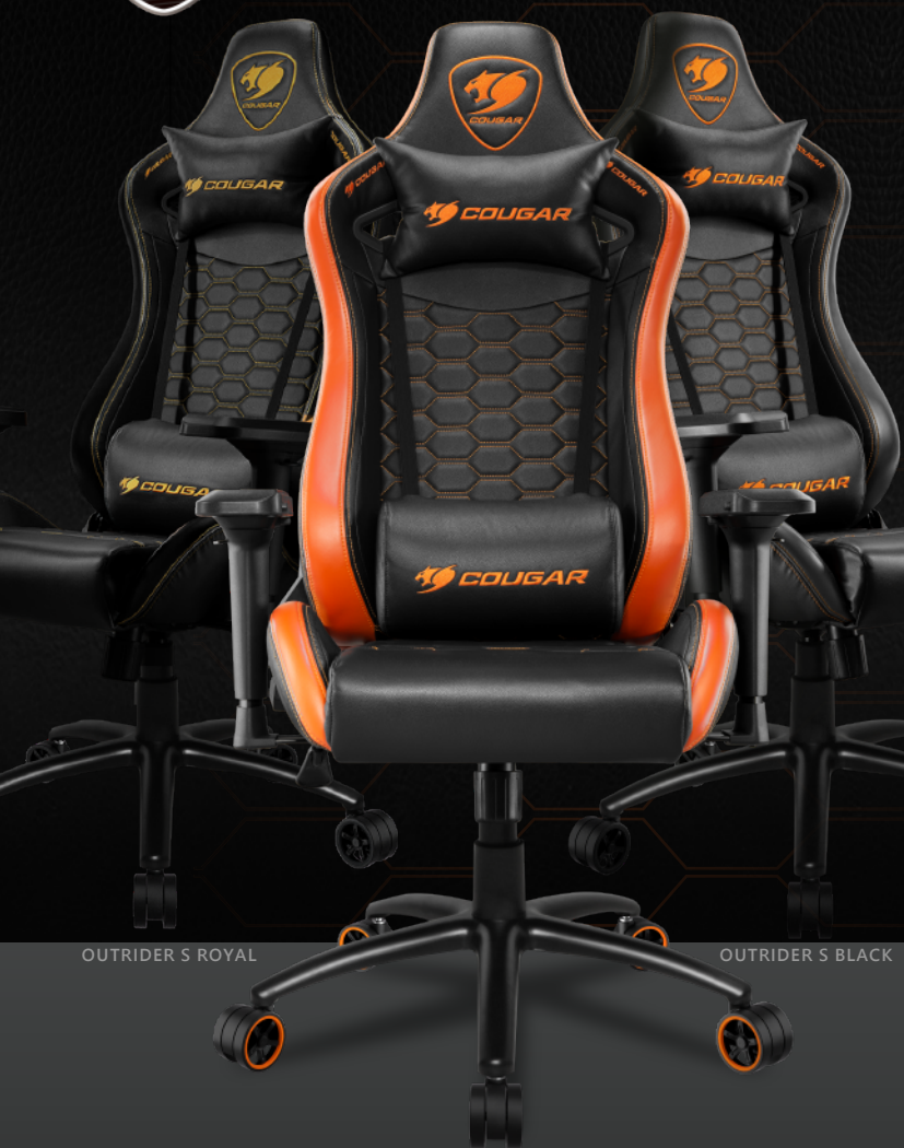
OUTRIDER S ROYAL