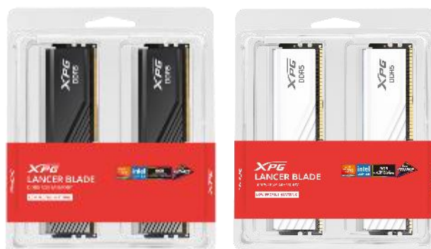
Dual Tray Package