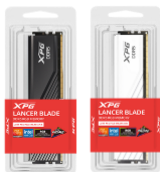
Single Tray Package